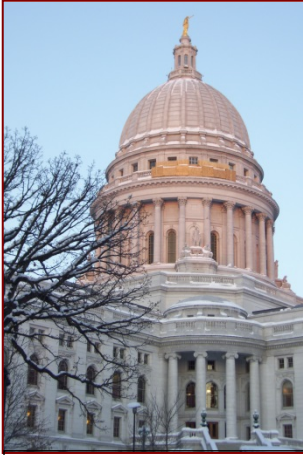
Wisconsin State Capitol

NHFA staff attorneys respond to requests from many state advocacy groups each year. Citizens are seeking guidance on how to form groups, become politically active to change laws, or make new laws, to protect health freedoms. Whether it is a group advocating for a safe harbor bill to protect access to natural health care practitioners, or access to