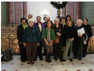
Members of I-ACT and Illinois Citizens for Health Freedom

NHFA assisted many groups in 2013, including: the Colorado Sunshine Health Freedom Foundation in the passage of the Natural Health Consumer Protection Act; Hawaii , where citizens are considering a safe harbor bill; The Illinois Citizens for Health Freedom and the Illinois Colonhydrotherapists in their work to defeat restrictive Dietitian bills, and to support safe harbor bill drafting to prepare to prevent the prosecution of unlicensed natural health practitioners including colon hydro therapists; Health Freedom